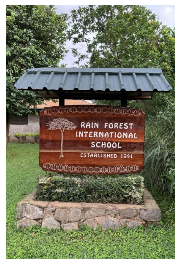
RFIS Campus Entrance

While in Cameroon, I will be traveling to meet with various CBC leaders around the country. I will meet with hospital administrators, nursing supervisors, chaplains, and directors of various departments – including health services, evangelism, missions education, and individuals involved in White Cross. Once again, we will evaluate and plan for the future. We will determine the best ways for the NAB to come alongside the CBC in order to assist the CBC in meeting their goals.