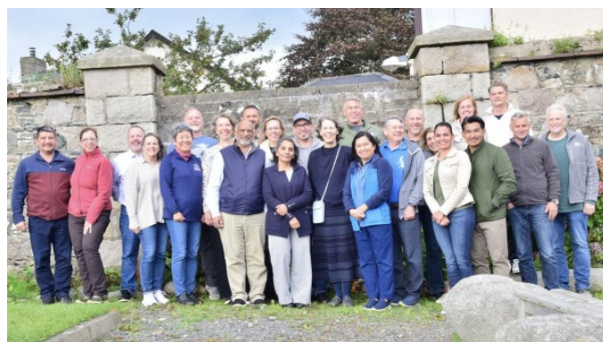
Global Summit Group

children to serve, and they are being obedient to the call. It is our privilege as NAB missionaries to continue to come alongside the CBC and serve together.