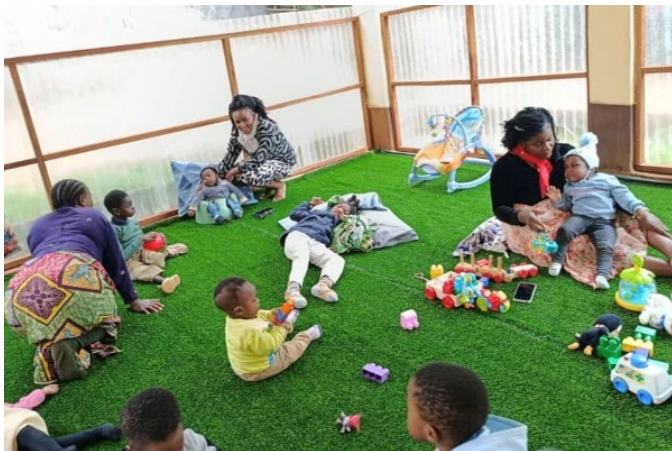
Bafoussam Inclusive Daycare Centre