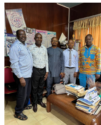
Some of the Central Pharmacy staff who assist White Cross