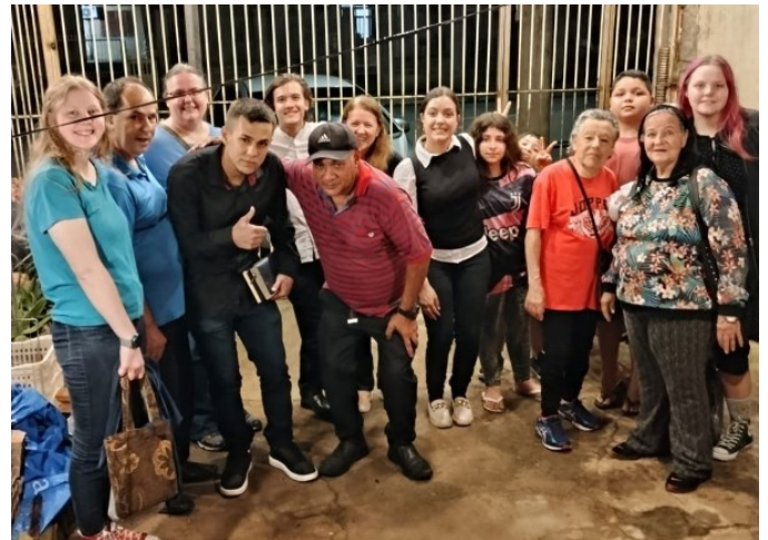
The church plant in Rio Branco, Canoas

Our church-planting network, RumoPlan, had its second gathering in August in Canoas, which is the largest suburb of Porto Alegre. The meeting included church planters