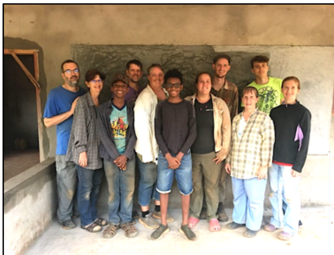
Some of the Jungle Jam work crew