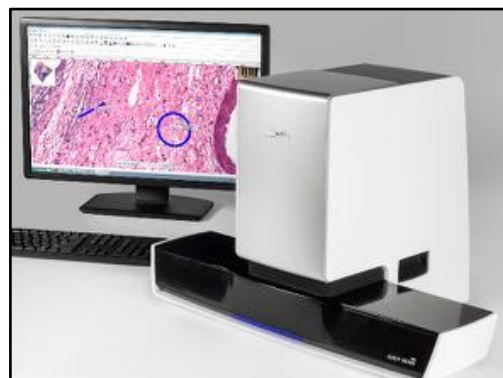
Automatic Slide Scanner