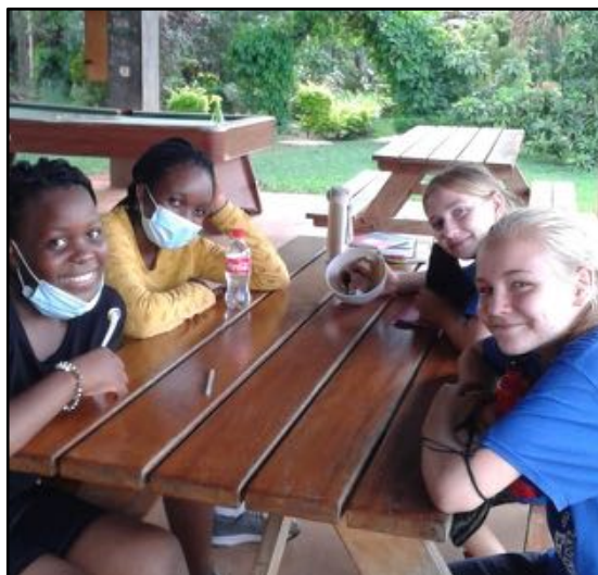
Some of my students at RFIS