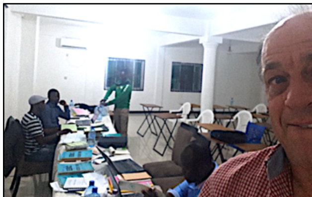
On an audit trip with FDD staff