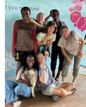
June was a busy month as we began packing, saying goodbye to friends and colleagues, and attending year-end events at Rain Forest International School (RFIS).