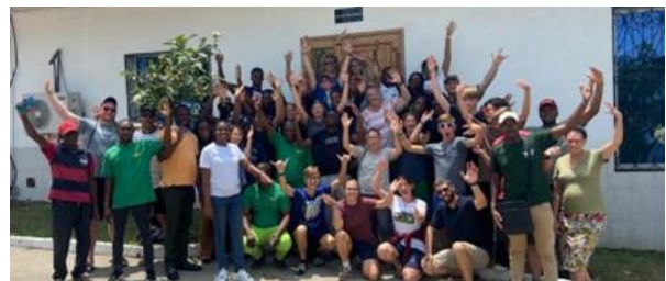
A quick group picture at the end of high school retreat before hitting the road.

As always, it has been a busy season at Rain Forest International School. The huge Valentine's dinner