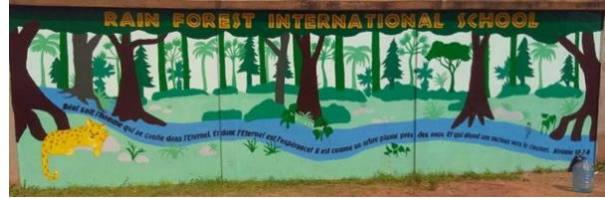
Some of our students spent their Spring Break giving a total facelift to the mural just outside our campus.

412 COLORADO AVE NW, ORANGE CITY, IA 51041, UNITED STATES TENCLAYK@GMAIL.COM NABONMISSION.ORG/MISSIONARIES/KRISTI-TENCLAY