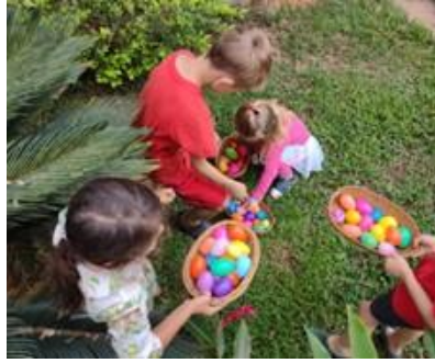
Easter egg hunt with the 'littles' on our compound.

I had been baking and preparing for in the weeks before my last newsletter went GREAT! We served about 150 people and heard nothing but good comments on the food and festivities. Since then, my kids (the senior class) have also served food at our school's annual Carnival (nearly 300 meals!) and hosted a massive 'garage sale.' Though successful events, we are all relieved to have them done for the year! Now I get to shift gears with them into my role as graduation coordinator, and they get to shift gears to planning their senior trip.