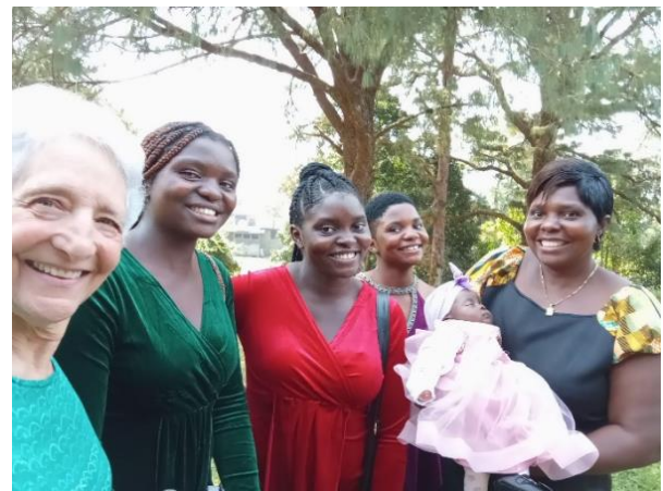
Celebrating a newborn baby of our friend.