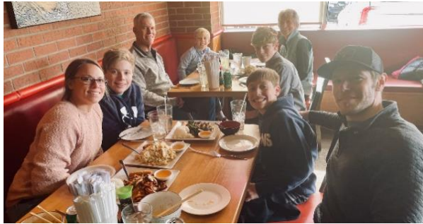
Enjoying some lunch after church with Jess' fam.