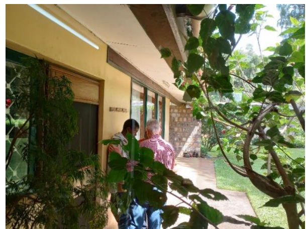
We have many opportunities to pray with folks who come to our door in need.