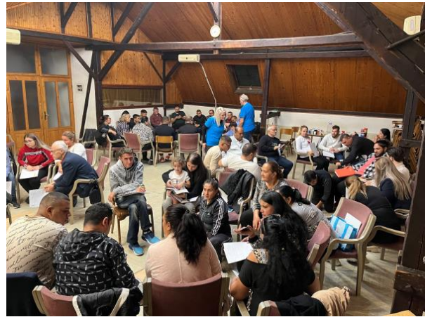
CHE trainers in blue shirts circulate among the discussion groups at the Vision Seminar in Leskovac, Serbia; 50 people attended.

At the same time as the medical screening, a very significant CHE event was taking place in the city of Leskovac, Serbia. Three trainers from the CHE Serbia team were presenting a CHE Vision Seminar to 50 members of one of the largest Roma churches in Central Europe and the Balkans. Our CHE lessons are very participatory, and the lead pastor of the church remarked that he was amazed at the enthusiasm, the mature answers, and wisdom coming from his people as they discussed how to transform their lives and their communities using CHE's biblical strategies.