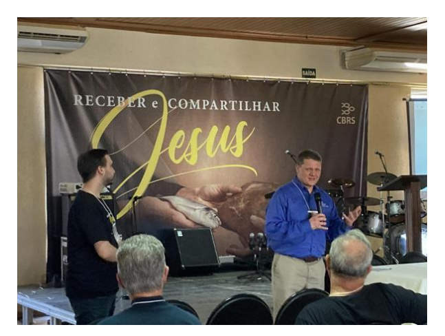
Every year, the Baptist churches of our state have a local missions campaign that focuses on church planting. This year's theme is Receber e Compatilhar Jesus – "Receiving and Sharing

Jesus." This theme comes from the story in the Gospels when Jesus feeds thousands of people, using just five loaves of bread and two fish. The disciples continued to receive food from Jesus and kept on sharing with the crowd until everyone was satisfied.