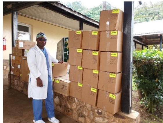
We celebrated the arrival of a White Cross shipment