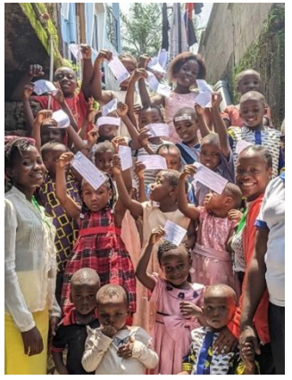
One of the VBS groups

her be able to go. She attended a training in the capital city and then was sent out to another city to lead VBS groups in different neighborhoods for the summer. She grew a lot spiritually and got to see how the Lord worked in many children's hearts through her. They reached 759 children during their VBS weeks, with 55 making decisions for Christ.