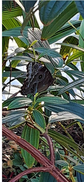
Butterfly in the butterfly garden, Winnipeg.