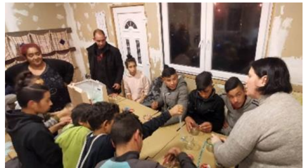
Craft time at Christmas Camp in Donji Petrovci, Serbia. Most children here do not read or write . . . yet.

We were able to hold the fourth Christmas camp in the Roma community of Donji Petrovci (DP). Children spent four days in a peaceful and joyful environment among people that love them. We were able to celebrate the birthday of Jesus, sing songs, play, hear stories, prepare cookies together, and so much more! At the end of the camp for some children this was a very sad moment. They said: “Can we stay here (instead of going home)?” or “I am really enjoying being here with you.” Some were crying as they had to go home. Please pray for their families to accept different/new/healthy ways of living life and taking care of their families.