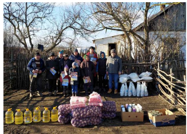
A December relief food delivery near Odesa, Ukraine.