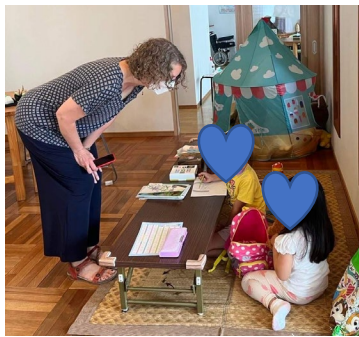
Young ladies at the seminar in Aichi.

the shop was closed. We found a bakery close by and started meeting there. One of the ladies who worked there started to recognize us and always greeted us with a smile and joyful, “Good morning!” When we arrived in July, she was not quite as joyful as usual and broke the news to us that the bakery was closing at the end of the month. We are sad not only that we will, once again, need to find a new place to meet, but more importantly, will not get to see our friend regularly. We pray that our love for Jesus was shining through us and he will be faithful in growing the seeds that have been planted.