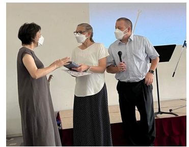
A small thank-you gift from Komyo Church.