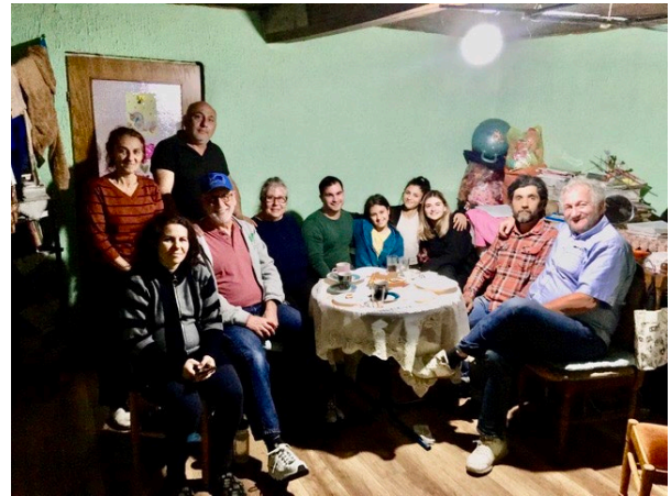
Celebrating the Lord's Supper on Maundy Thursday with new believers in Nadalj, Serbia.