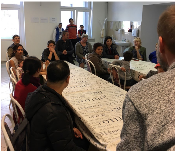
Pre-Easter meeting with refugees in Zamardi.

In addition, the CHE Hungary team is responding to emergency needs for assistance. For example, two weeks ago, we took a vanload of food and toiletries and did a pre-Easter program in a government-provided camp in Zamardi.