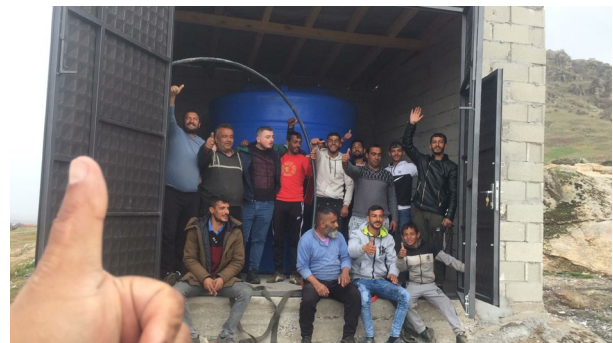
The men from Meksiko celebrate putting the 10-ton water tank in the tank house they constructed.