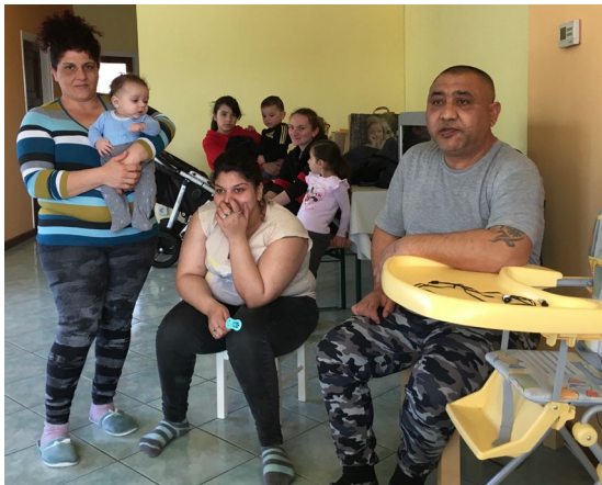
Roma and Ukrainian families from Ukraine

First a word about our part as the CHE Hungary team in ministering to Ukrainian refugees. Some 300,000 of them are seeking safety in Hungary as the terrible conflict rages in their home country. Since our primary mission here is doing Christ-centered community development in impoverished communities, we decided not to set up our own relief program for refugees. Instead, we have