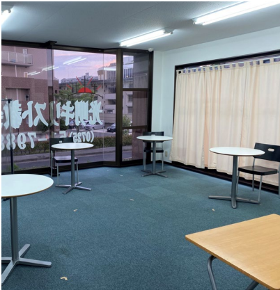
English class and Bible study setup

Like many of you, we are trying to continue ministry under this unique situation with COVID-19. Proverbs 18:15 says, "Intelligent people are always ready to learn. Their ears are open for knowledge." So that is what we are trying to do. We are