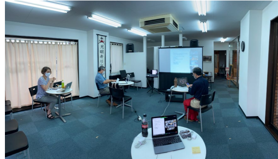
JBC regional gathering for Zoom meeting