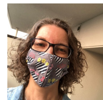
My neighbor made me some masks! So, I made her some cookies!

Like most of you, we also are praying about how we can continue to love the Lord our God with all our heart, soul, mind, and strength and to love our neighbor as ourselves. You are on my mind and in my prayers. Thank you for your continued prayers and support. You make it possible for me to be here serving and loving my friends.