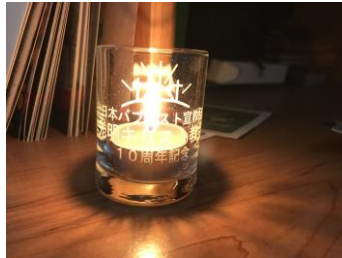
Anniversary favors with church's name and symbol of the crosses