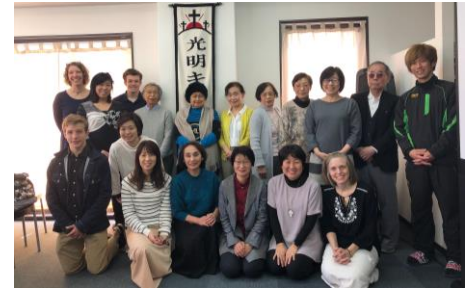
Many of our faithful attenders

James 1:2 encourages us to consider the joy when going through trials and troubles. To consider; to contemplate; reflect; bear in mind; the joy, which can be found if we are willing to look up and see it. Joy is in the simplest things, a child's helpfulness in doing laundry, co-workers' prayers, team members taking over leadership, kind gestures of fruit, flowers, and all the hugs. When we rest in that joy, our faith grows in perseverance, which changes our perspective to see God at work.