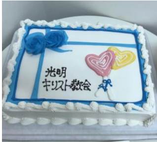
Our Church's name in Japanese