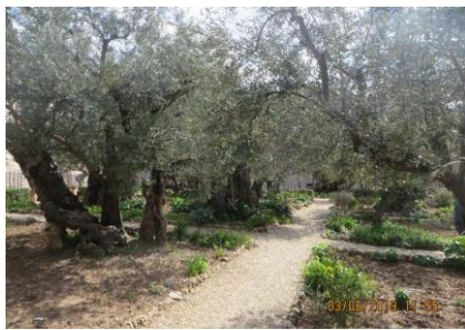
Garden of Gethsemane (Olive trees)