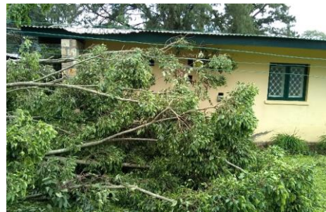
The big storm damage

When we think of spring we think of new life and new beginnings. We are praying that new beginnings can take place in Cameroon and there can be a means of beginning peace talks. It almost seems like a joke to talk of it now after 3 years of uprising, but all things are possible with God.