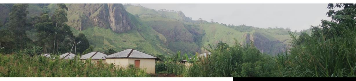
KRISTI TENCLAY - Missionary in Cameroon