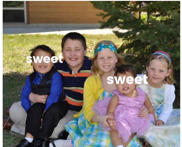
Our kids with their foster siblings on Easter. (Due to regulations we are unable to show the faces of our foster children.)