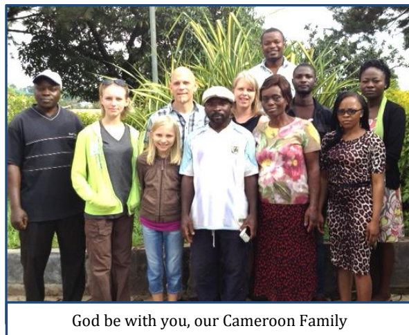
God be with you, our Cameroon Family

During the next eleven months here in North America we will be saying hello multiple times as we meet up with friends, family and supporters. And for just as many hellos there will be an equal number of goodbyes – usually after too brief a time of re-connecting. Pray with us that the joy of the hellos will be stronger than the pain of the goodbyes .