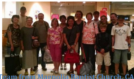
Team from Magnolia Baptist Church, CA