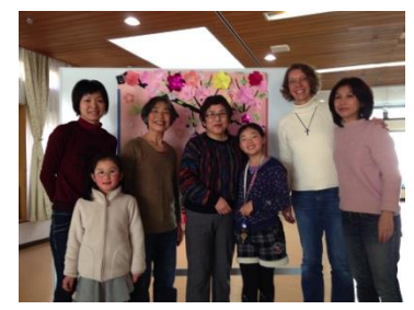
February nursing home volunteers

As a church family, we continue to volunteer at the nursing home behind the church. Every other month we have an origami class for the residents where we fold origami, chat, and laugh together. Several of the ladies also volunteer at the home's coffee hour a couple of times a month. We are getting to know the residents, staff, and some of the residents' family members.